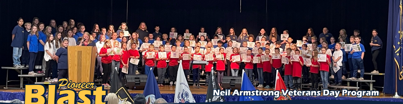
Neil Armstrong Veterans Day Program