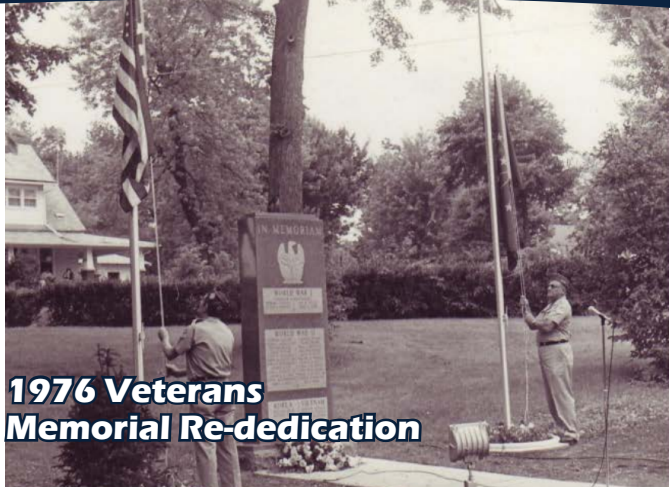
1976 Veterans Memorial Re-dedication