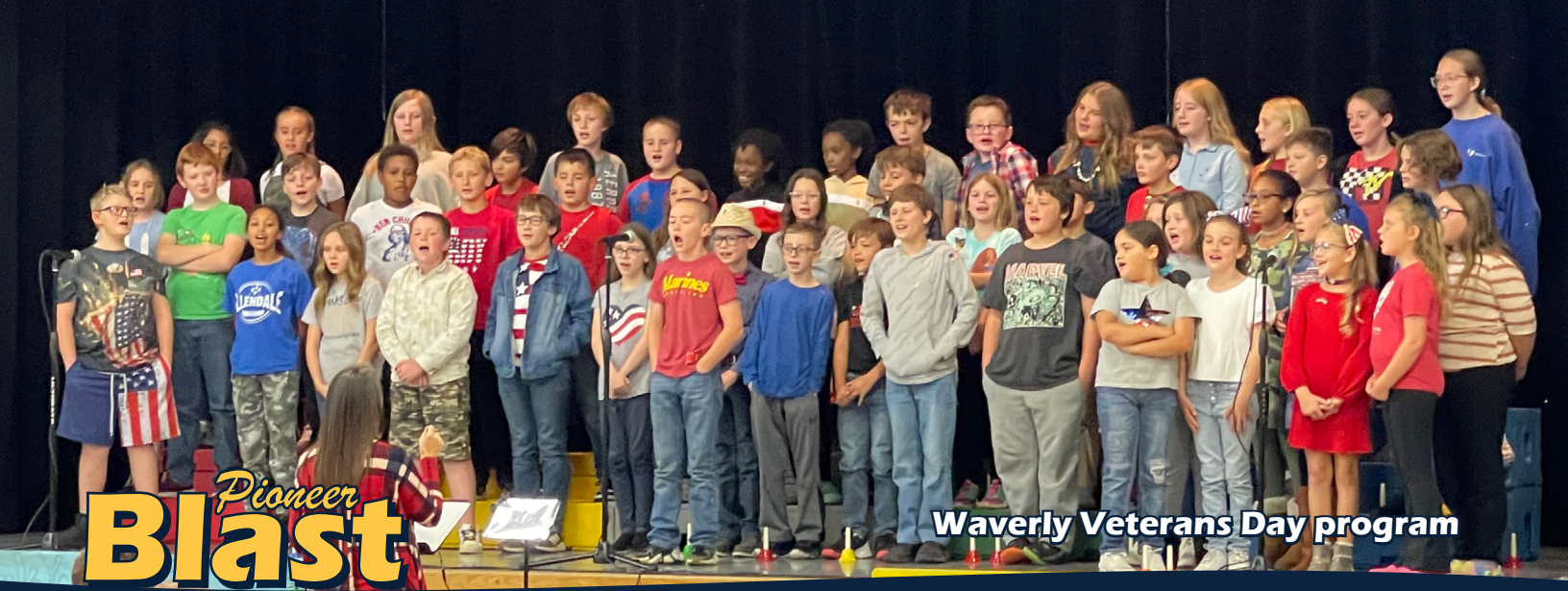
Waverly Veterans Day program